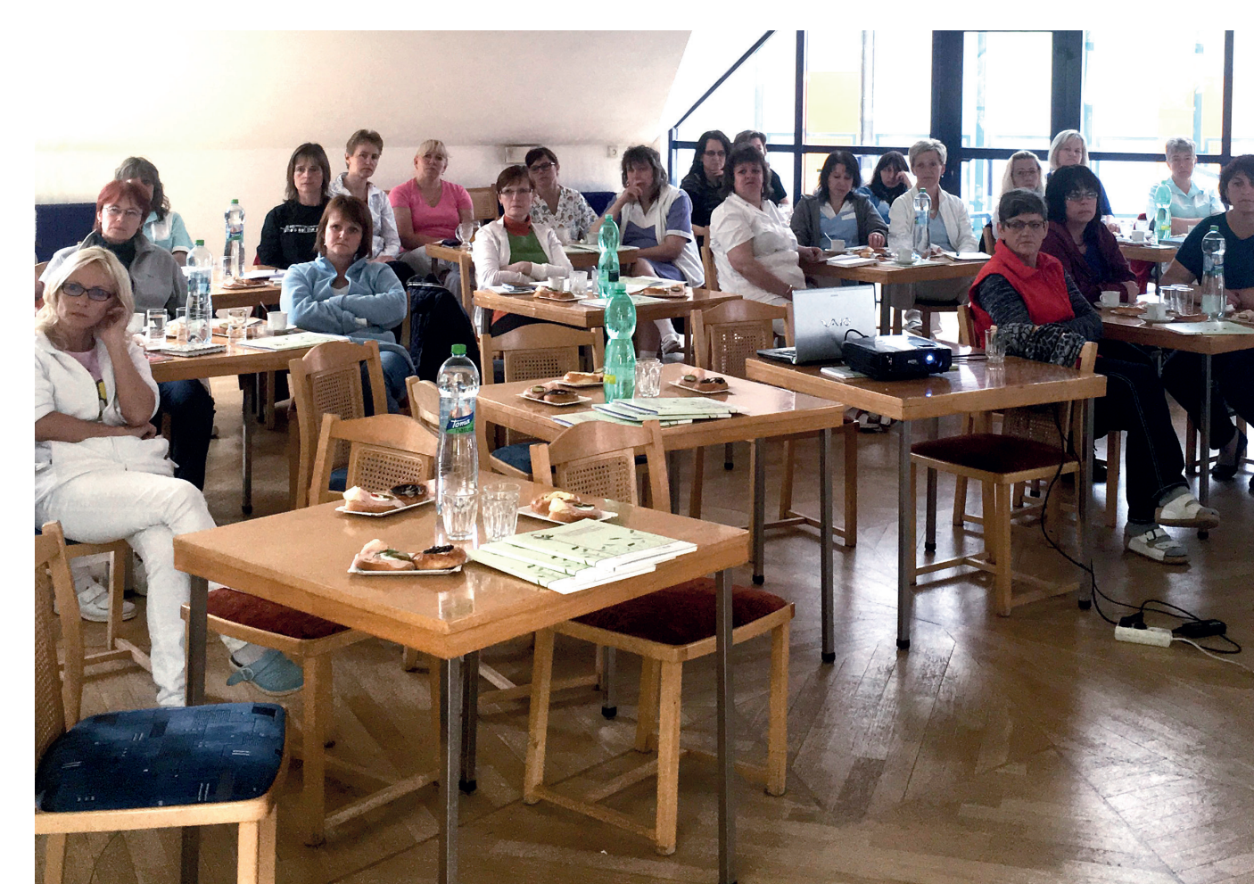
Fig. 4 Lecture in one of the residential facilities.

Spreading of the awareness about HD in residential care facilities could help to increase the quality of life of HD patients.